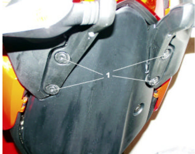
Legend to Diagram #1